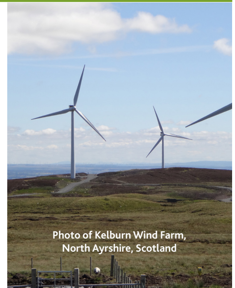
Photo of Kelburn Wind Farm, North Ayrshire, Scotland

Onshore wind has a critical role to play in helping stabilise and secure our future energy needs, and projects such as Cairnmore Hill provide real opportunities for helping to achieve this.